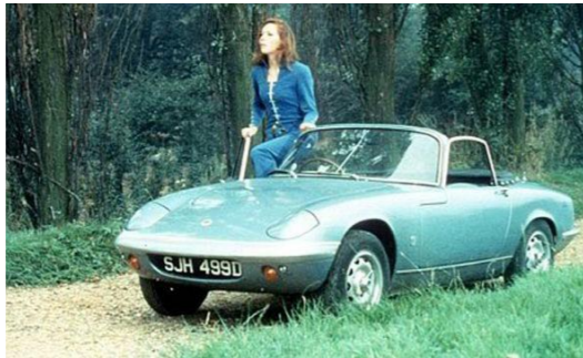
Name the TV Show