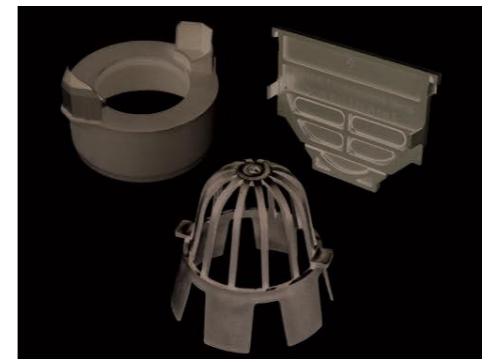
Name the Product