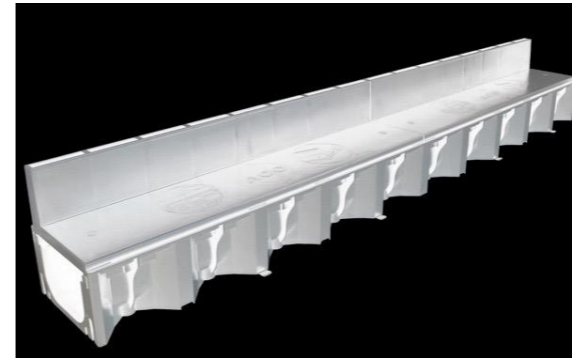
Name the Product