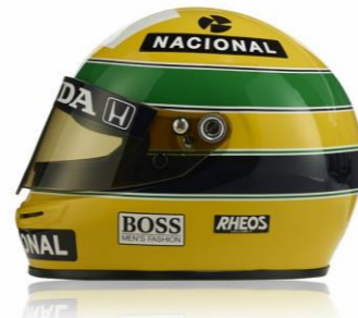
Name the Driver