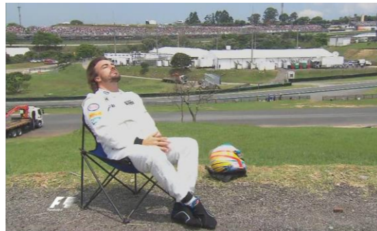
Name the Driver